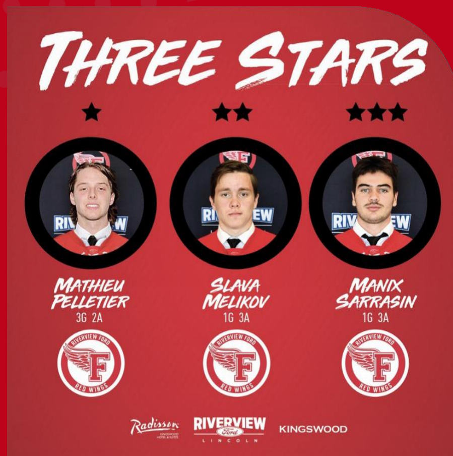
THREE STARS OF THE GAME