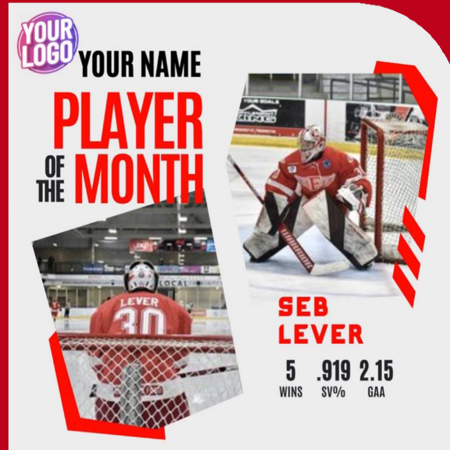
PLAYER OF THE MONTH